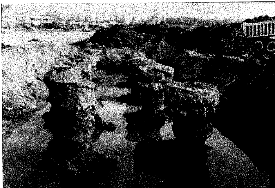
Figure 1. Trial excavation of jet grout columns (Eker. 1999)

Under such difficult conditions, the results of the trial excavation were successful. The constructed test bodies showed that the combination of the predetermined operational parameters resulted in obtaining the required project diameter (80-cm) in the subject cohesive soils. Also, in randomly excavated areas of the site, the required diameter of the columns was maintained.